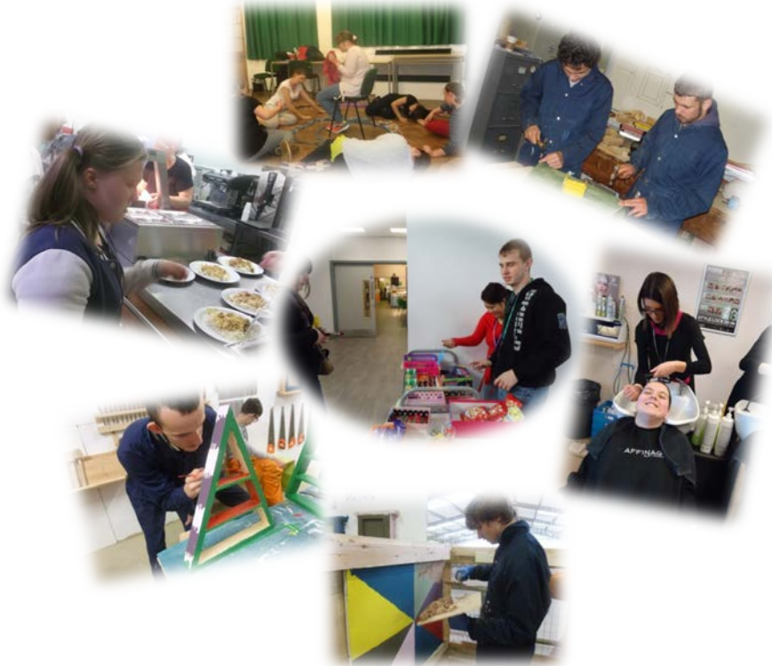
Students experiencing Vocational opportunities on College Links courses

Students attending a full time college course will be given information and guidance as part of their course as well as work experience opportunities. If employment is a desirable option at the end of training or college, Additional Needs Pathway Advisers and the Job Centre will be able to advise on individual cases, and this will be discussed during the Annual Review process at College.