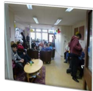
Students using the outside area and the Post 16 Common Room