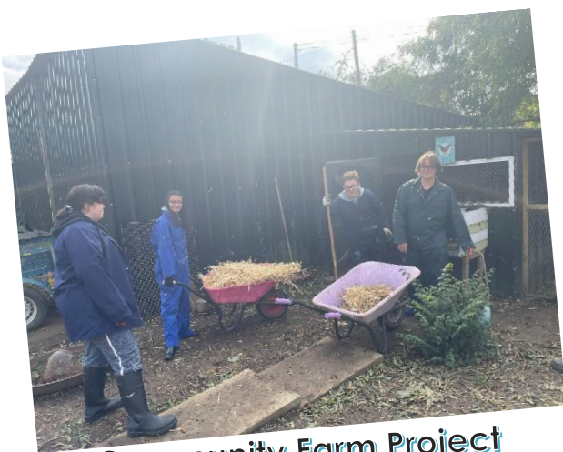
Community Farm Project

As part of the Preparation for Adulthood (PFA) curriculum, our pupils are encouraged to examine their likes, interests and strengths. Workplaces, Further Education Colleges and Social Firms are visited and students become familiar with some of the local facilities they may wish to access, once they have left school. In doing this they are also able to start finding out about the opportunities available to them.