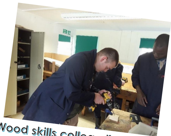
Wood skills college link course