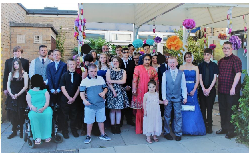
Students celebrating their achievements at the Post 16 Leavers Prom in July 2018

Each autumn term, an open evening is held at the school when you will be able to gather information and ask questions of the various agencies who make provision for school leavers or provide advice. Parents and their children are strongly advised to attend this "Moving On" evening on Wednesday 14 th November 2018 but if this does not prove to be possible, you will find the information in this booklet and the agencies listed at the back very useful. Throughout this booklet, the term 'carers' can be substituted for 'parents'.