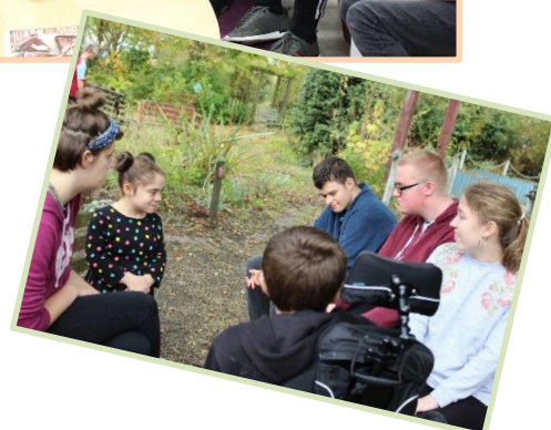
Students enjoying our common room and outside spaces