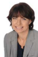
Head of School February 2020

Spring Common Academy, American Lane, Huntingdon, Cambridgeshire, PE29 1TQ 01480 377403 office@springcommon.cambs.sch.uk