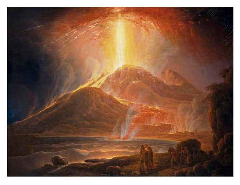
Mount Vesuvius in Eruption 1780